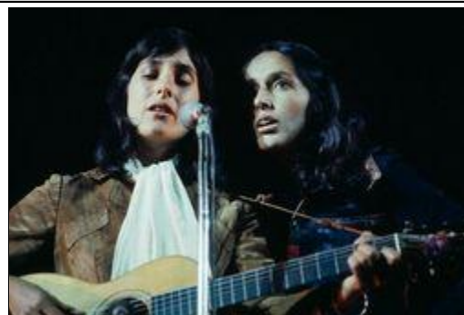
Bread & Roses founder Mimi Fariña, (left) performing with sister Joan Baez (right).

Bread & Roses produces over 600 shows each year. Though the organization has a long wait list for aspiring partner organizations, Bread and Roses staff were so impressed with the work and mission of Openhouse that we were bumped up the list! This December's Holiday Party will be our first event in partnership with this wonderful organization. Stay tuned for more entertainment news, and, let us know what kind of music interests you!